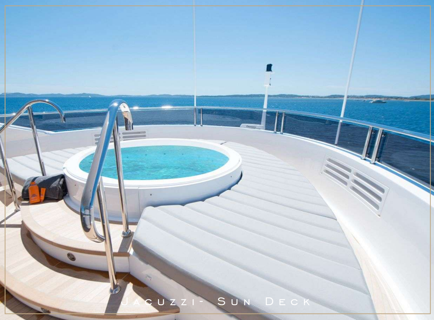
JACUZZI - SUN DECK