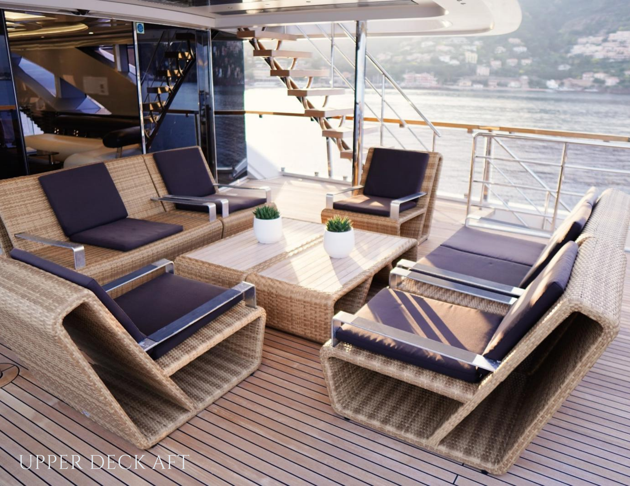
UPPER DECK AFT