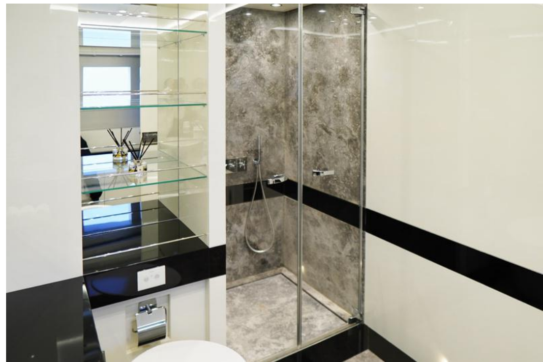
VIP CABIN BATHROOM