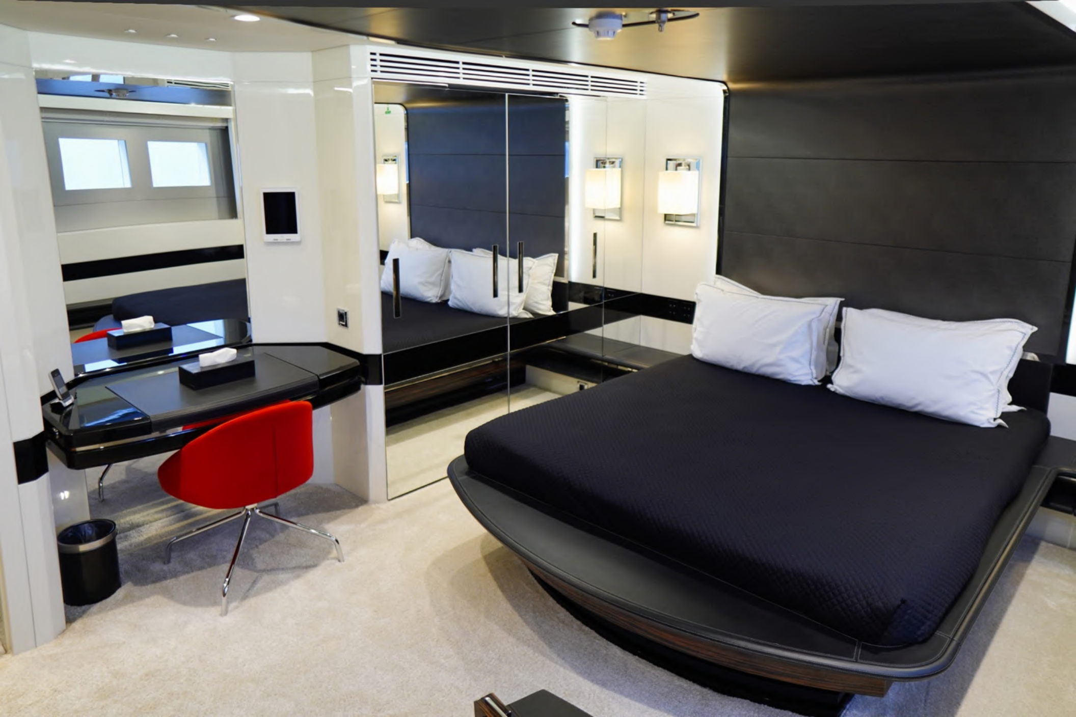
VIP CABIN 1