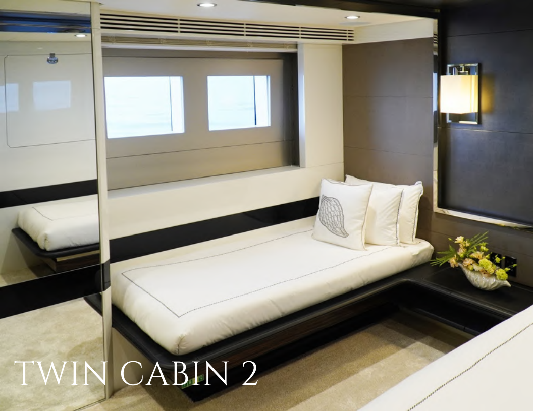
TWIN CABIN 2