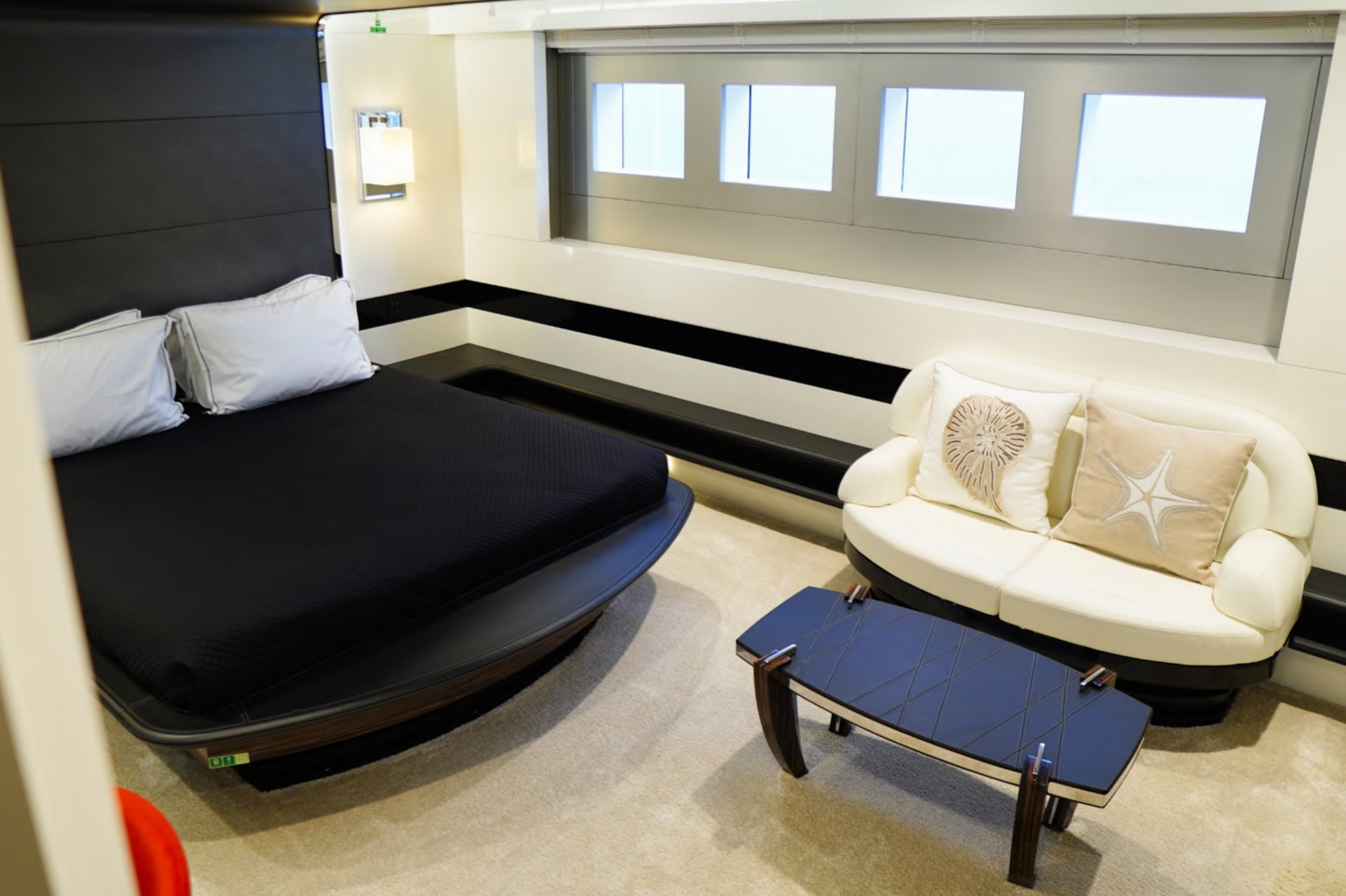
VIP CABIN 2