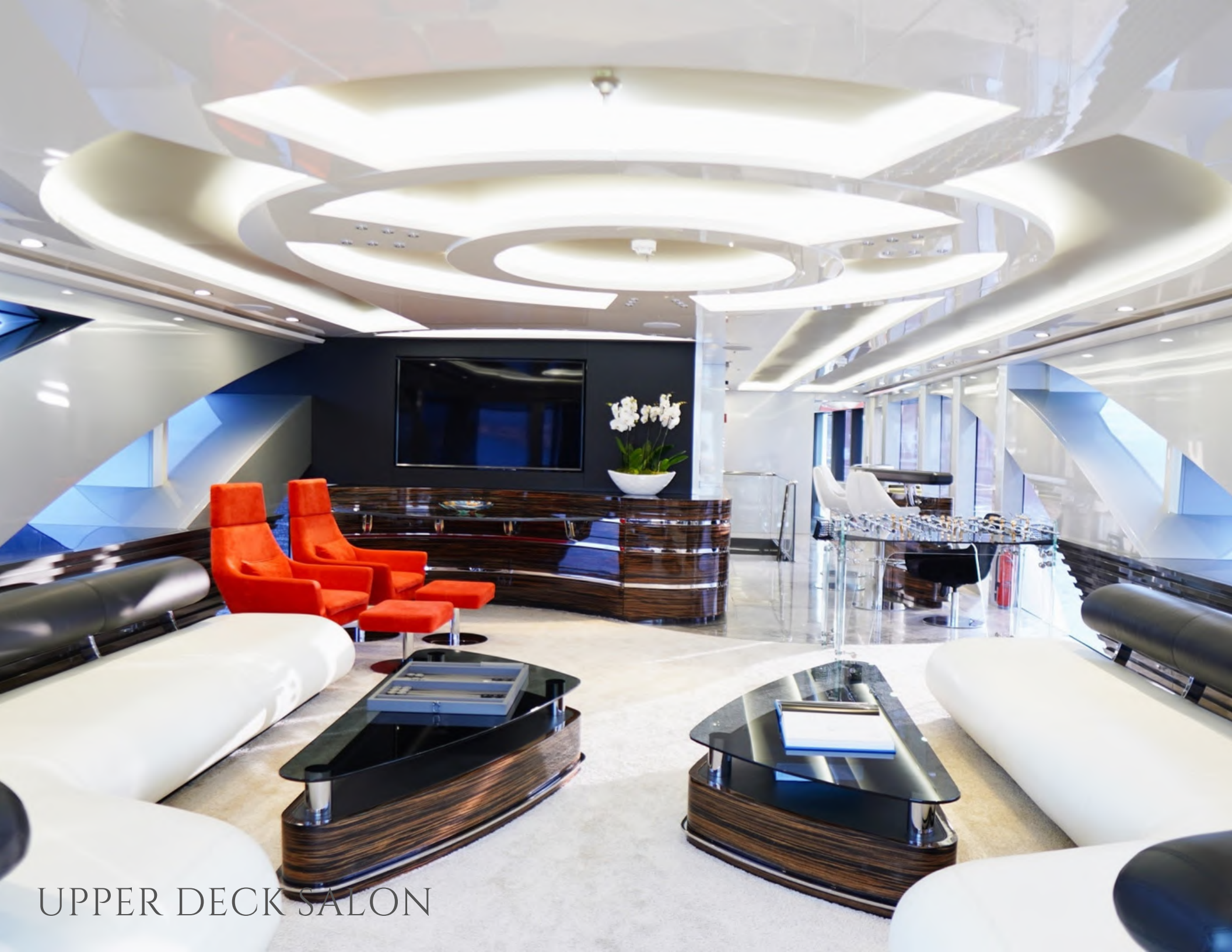
UPPER DECK SALON