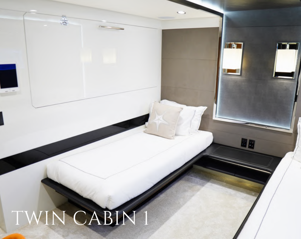
TWIN CABIN 1